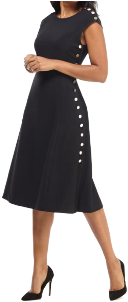
Heart of Hearts Perfect Pear